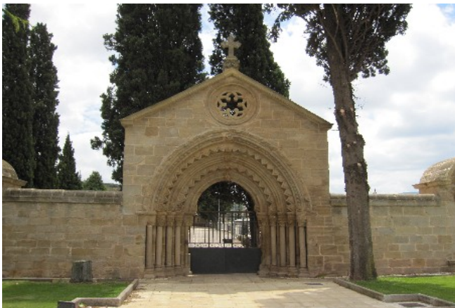
An old Monastery Gate rebuilt in front of a cemetery.