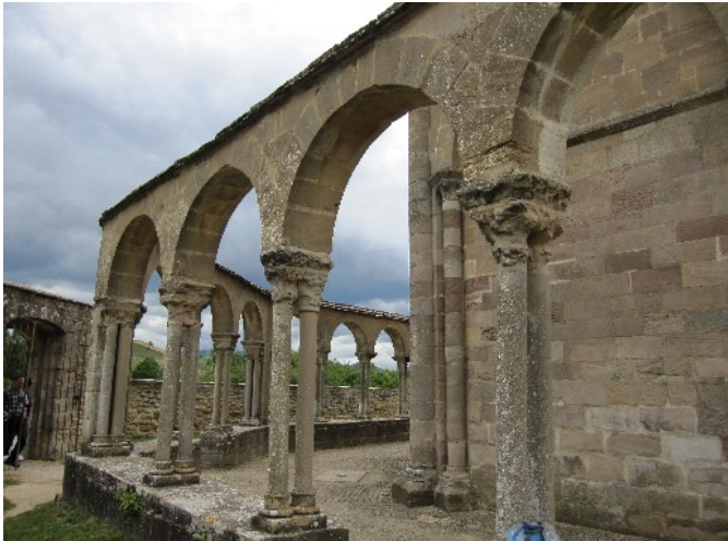
Eunate, a twelfth century church along the Camino de Santiago.