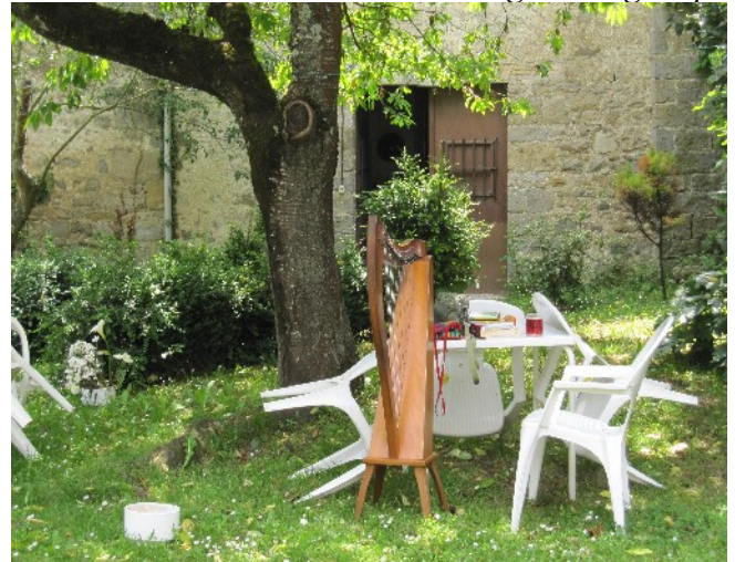
Brother Pluck's harp sits in the courtyard of a 13 th century Spanish Monastery.